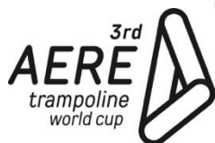
FIG TRAMPOLINE WORLD CUP BRESCIA - ITALY 4-5 JUNE 2021