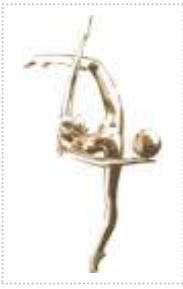
FIG RHYTHMIC GYMNASTICS WORLD CHALLENGE CUP INDIVIDUAL AND GROUP Moscow (RUS) 19 - 21 AUGUST 2022