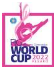
FIG RHYTHMIC GYMNASTICS WORLD CUP INDIVIDUAL AND GROUP PESARO (ITA) 03 – 05 JUNE 2022