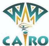
FIG Apparatus World Cup Cairo, Egypt 27-30 April 2023