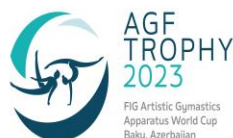
FIG Artistic Gymnastics Apparatus World Cup AGF Trophy Baku, Azerbaijan March 9-12, 2023