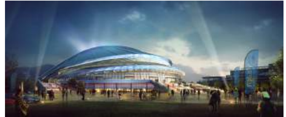
Huanglong Sports Centre Gymnasium