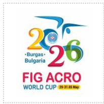
FIG ACRO WORLD CUP BURGAS, BULGARIA 29-31.05.2026