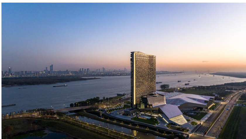
Nanjing Yangzi River International Conference Center

With a total area of 8,750 m 2 and a seating capacity of around 3000, additionally, it has multiple suites, small meeting rooms and other facilities which could be transformed to meet any necessary needs.