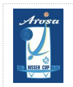
FIG TRA WORLD CUP - 51ST NISSEN CUP AROSA - SWITZERLAND 3-4 JULY 2020