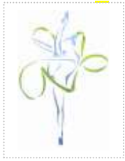
FIG RHYTHMIC GYMNASTICS WORLD CUP TASHKENT (UZB) 17 -19 APRIL 2020 INDIVIDUAL AND GROUP