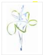
FIG RHYTHMIC GYMNASTICS WORLD CUP TASHKENT (UZB) 17 -19 APRIL 2020 INDIVIDUAL AND GROUP